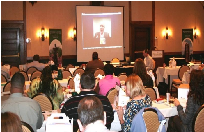
Above: Webinar from the Spring 2011 GCCA Conference in Brasstown Valley Resort, Young Harris, GA; Below: MSU Graduates