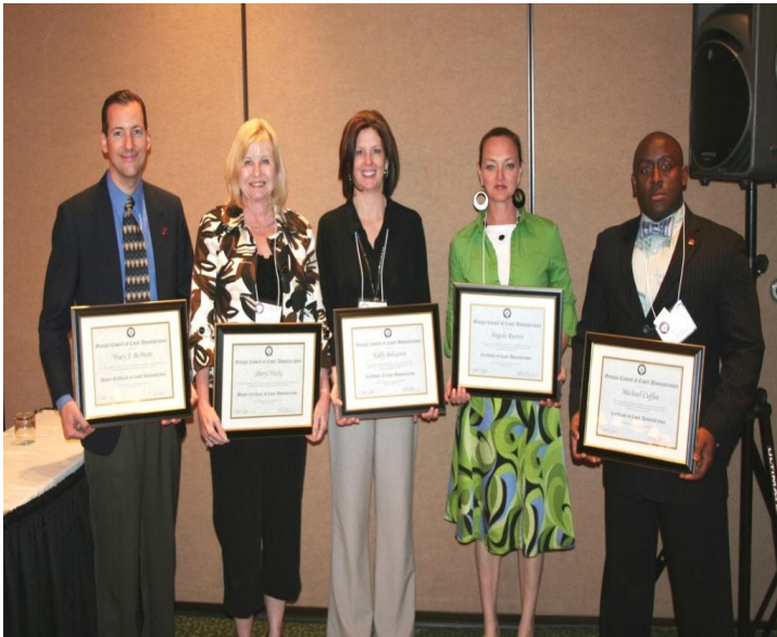
GCCA Graduates – Spring 2011